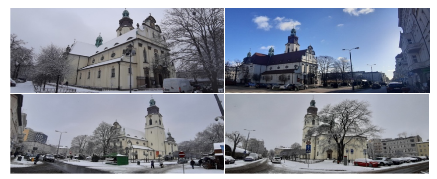
Figure 3. a - d View of Piastowski Square from Sniadeckich Street towards the north-east, east, north-west and south. The space is dominated by the shape of the church. Heart of Jesus. Space surrounded by nineteenth-century multi-family tenement houses with services on the ground floors, source: photos by the author

spaces do not leave space for pedestrians, source: photos by the author