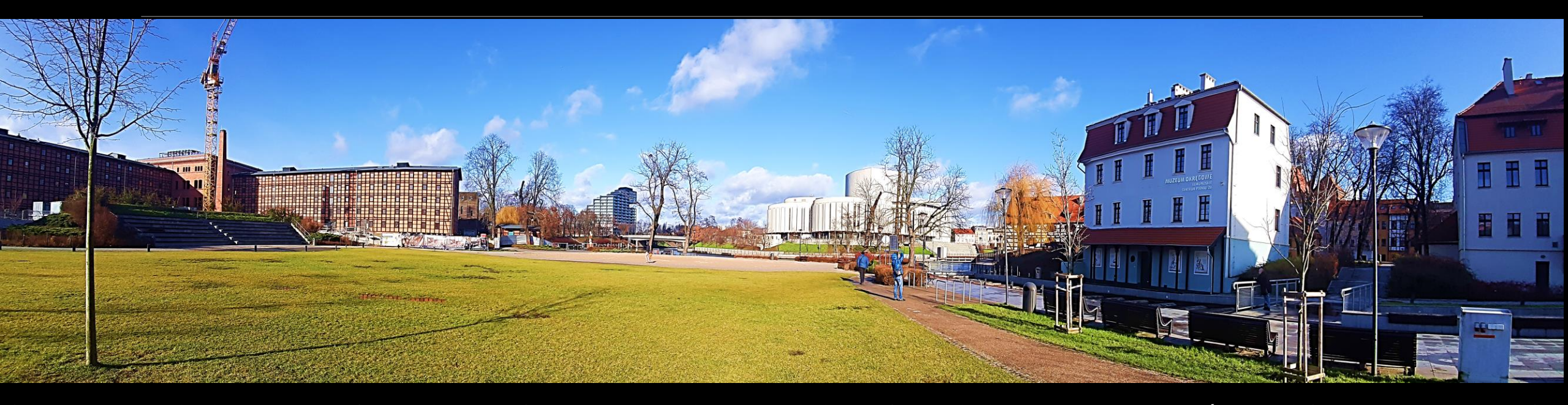
Figure 2. The revitalized space of the Mill Island from the east with the buildings of the District Museum L. Wyczółkowski, from the west side of Rother's Mill, from the north the Nordic Haven tower and Opera Nova.