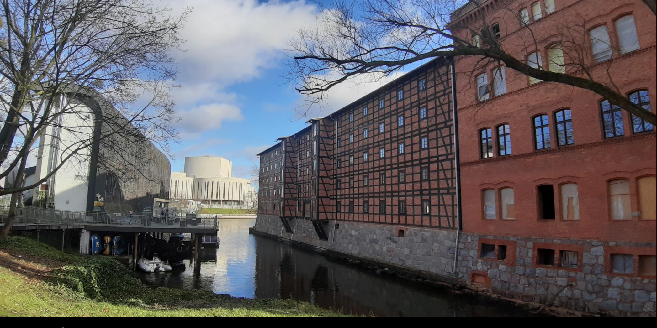
Figure.6. View of the Mill Island with Rother's Mills and Marina Hotel, (source: photo by the author)