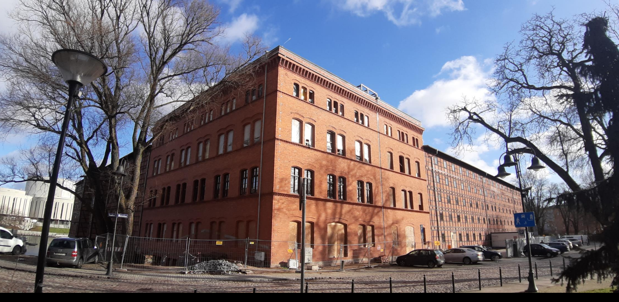
Figure.5. View of the Mill Island with Rother's Mills, (source: photo by the author)