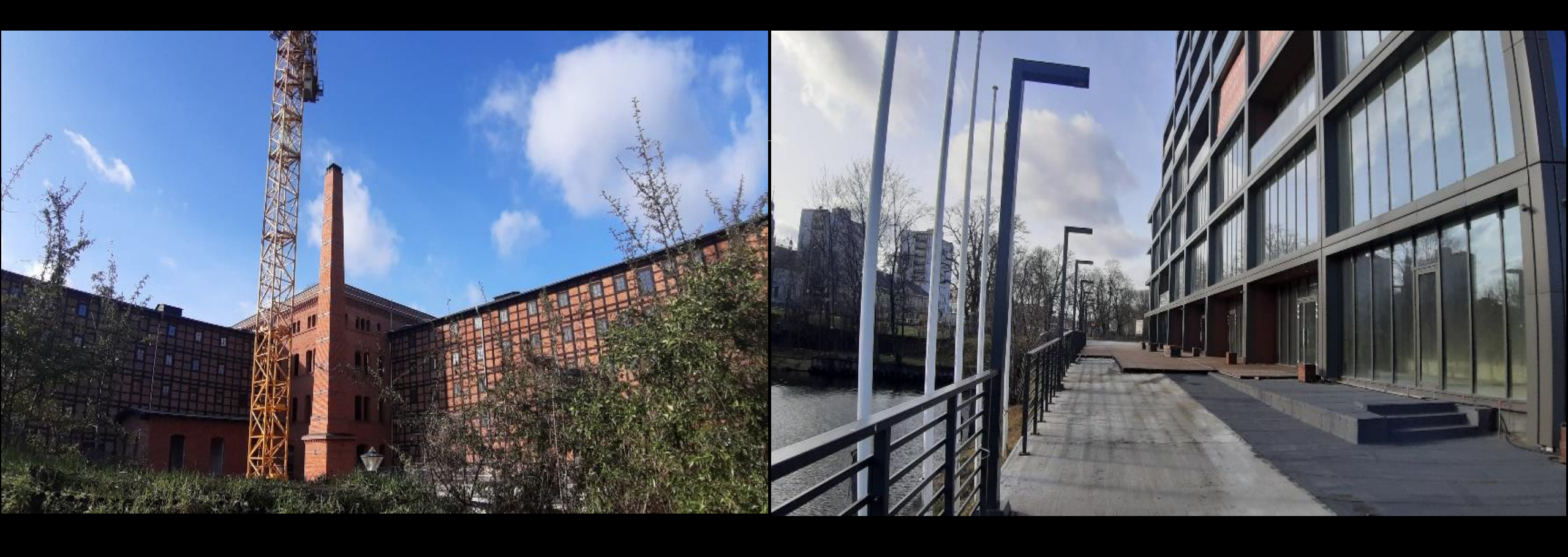
Figure 4. a, b - Mills Rothera solid historical and contemporary Nordic Haven facility, (source: a, b – photo by author)