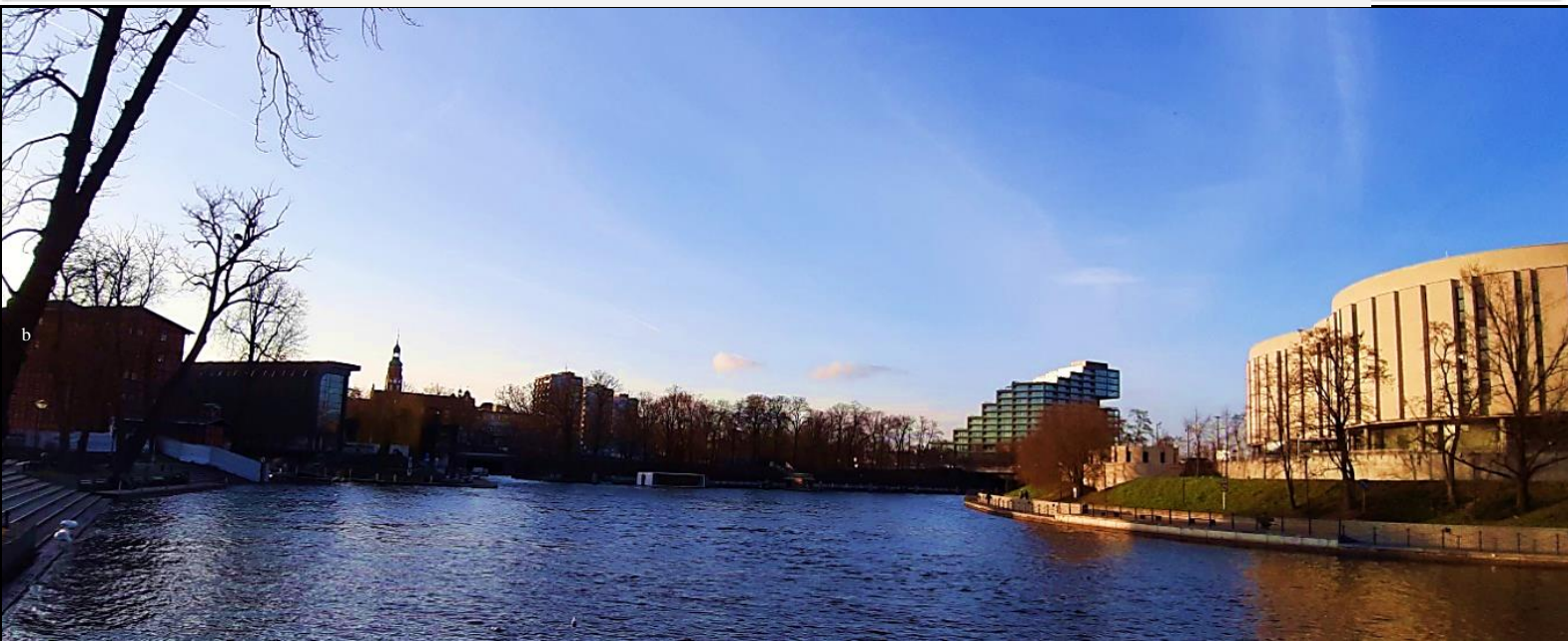
Figure 3. a, b - Downtown part of the Old Town with a cross section showing the architectural domonants of this area. View of the Mill Island with Rother's Mills and the opposite Nordic Haven object