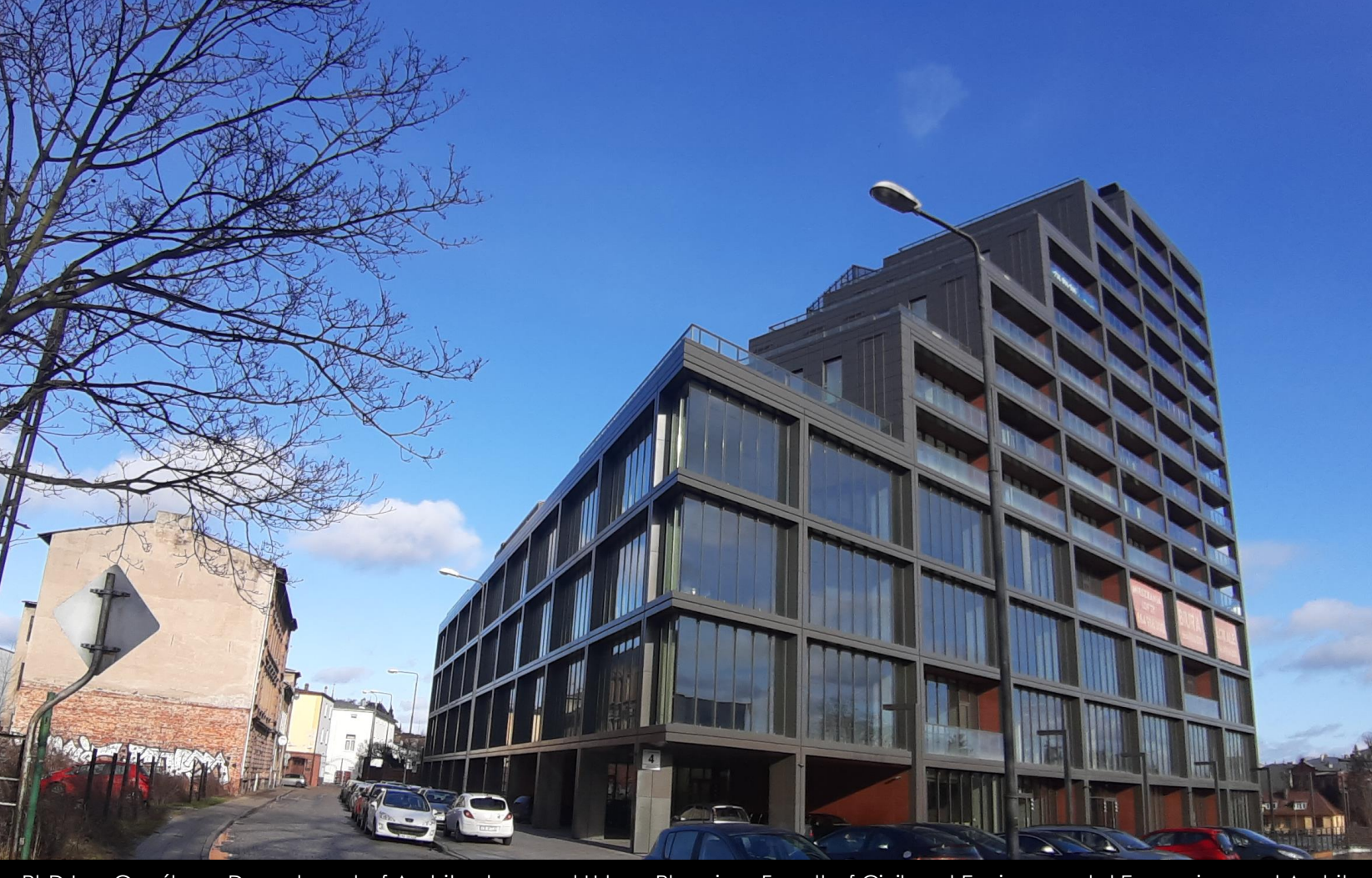
Figure.8. View of the Nordic Haven object, from A. Grottgera street