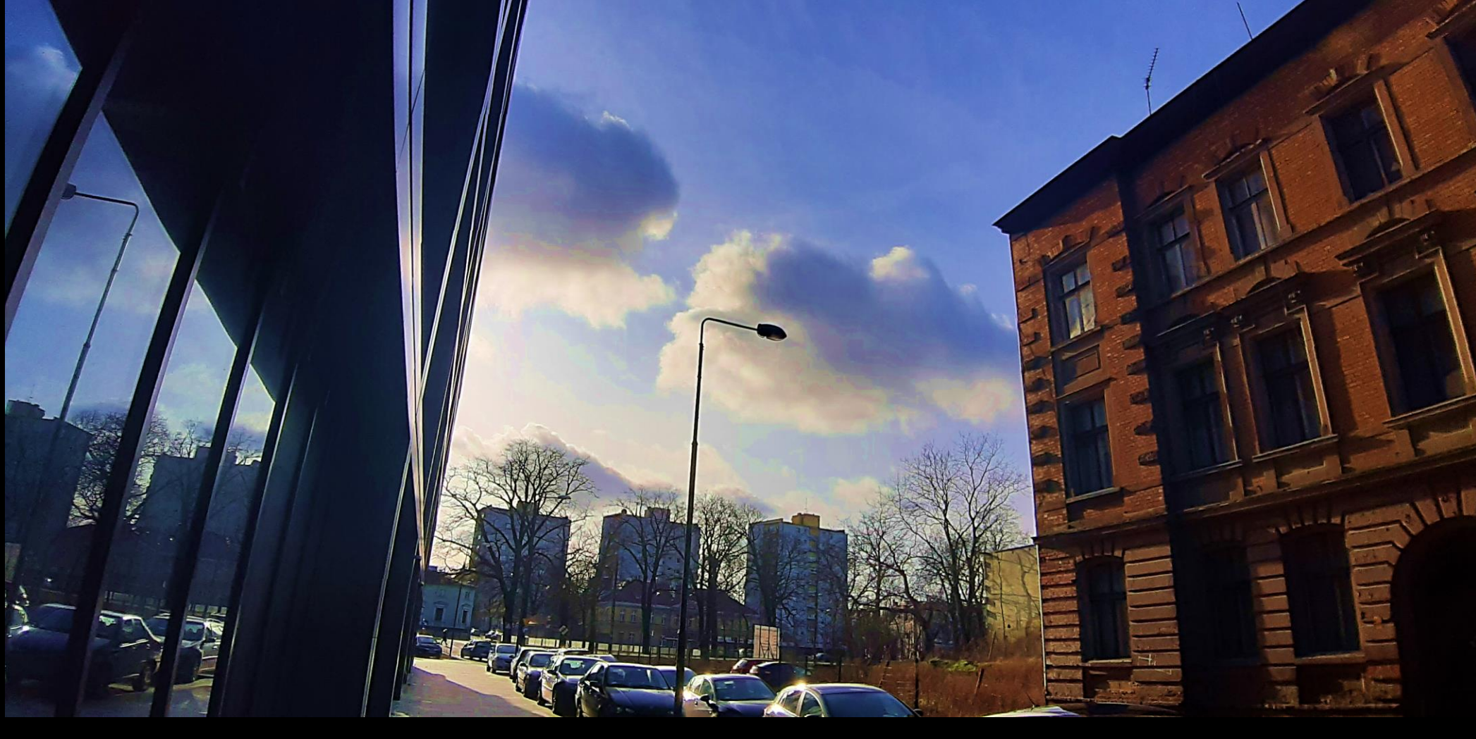
Figure.9. View of the Nordic Haven object, from A. Grottgera street