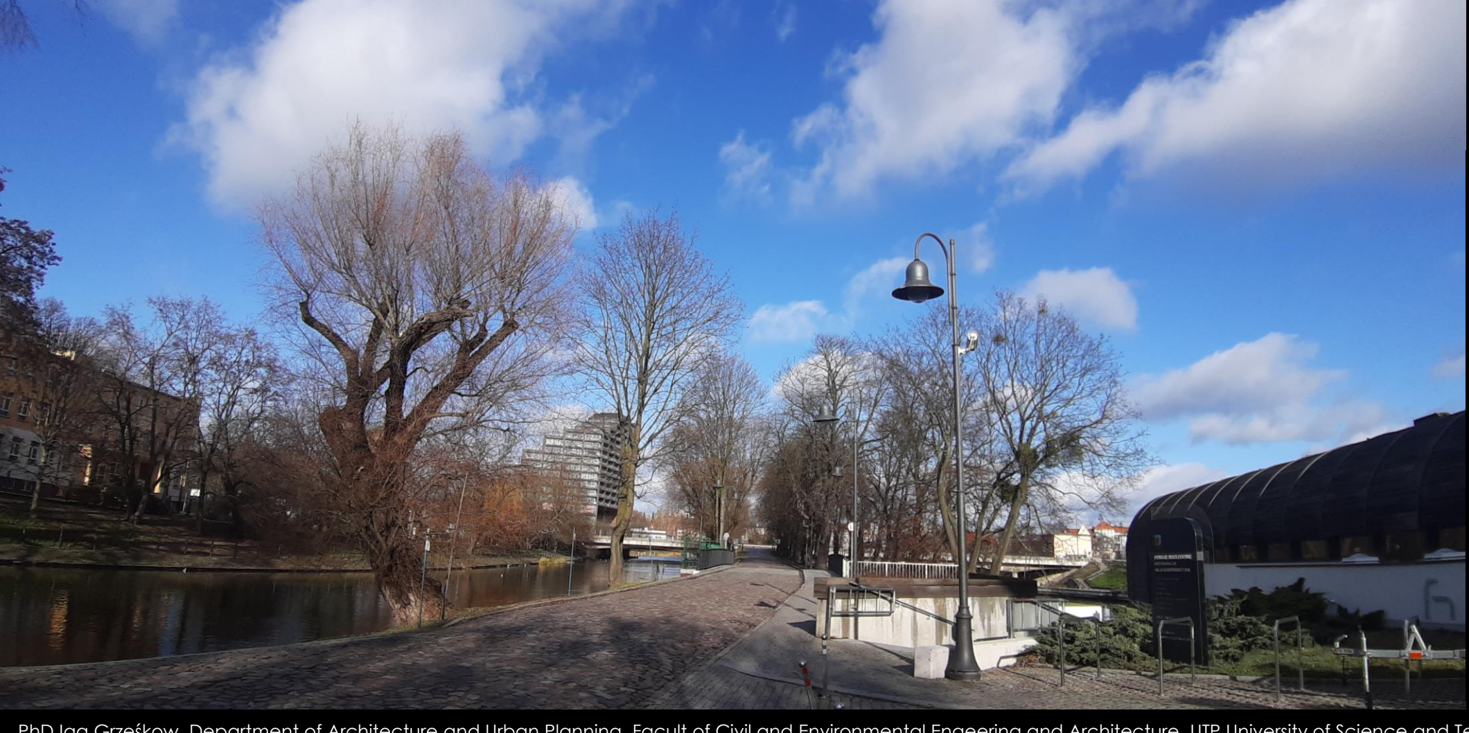
Figure.7. View of the Mill Island with opposite Nordic Haven object, (source: photo by the author)