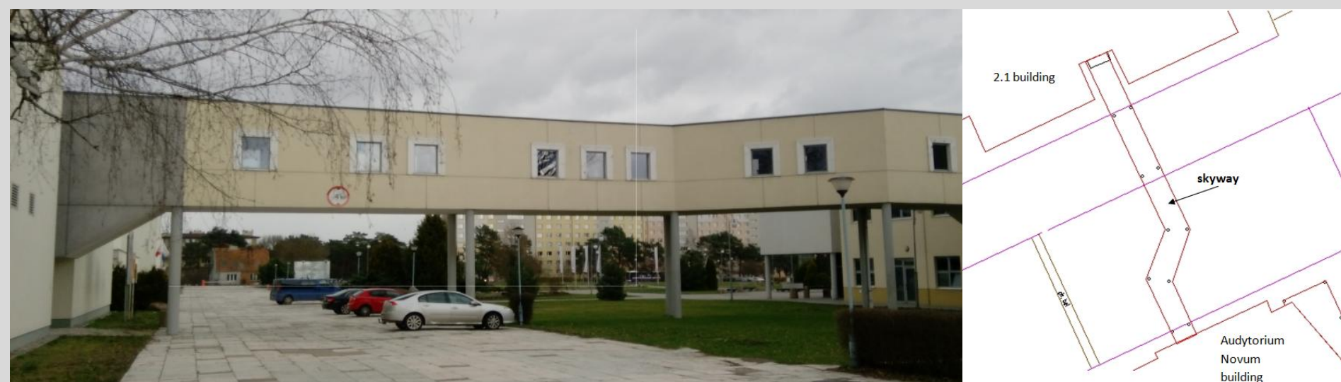
Fig. 1. The outside and shape of investigated object

After eighteen years of use, scratches and cracks were noted on the walls and floor of this structure. They indicate the presence of deformation in its structure. The scratches were examined on an object located on the UTP campus in Bydgoszcz. It was built in 2001 and has since served as an above-ground passage connecting University buildings. The outside and shape of the structure are shown in Figure 1.