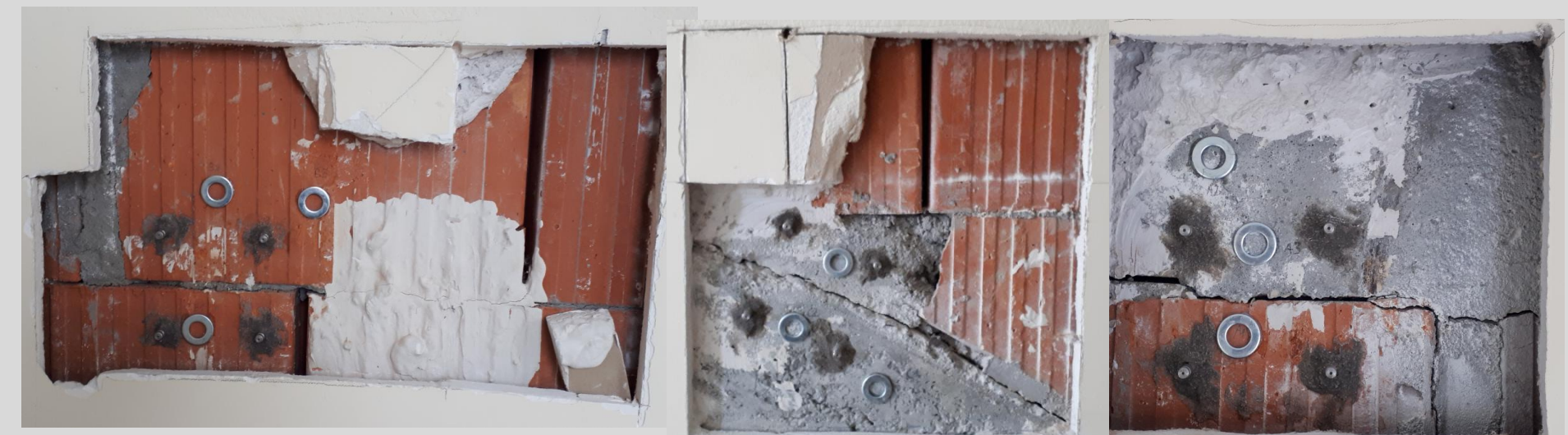
Fig. 3. The location of the measuring network of two methods next to the resulting cracks

As part of the investigations in the places of structure cracks, the SHM X crackmeter was used to measure the crack width. At the same time, geodetic measurements of the displacement and control network were made. Measurements using the TDRA6000 laser station with instrumentation allowed us to obtain submillimeter accuracy of determining point displacements. The network-controlled points were also placed in places where the crack opening was directly observed. This gave the opportunity to observe the displacements of the scratches in a uniform spatial coordinate system. The results of opening the scratches obtained from both methods were also compared. Figure 3 shows the location of the measuring network of two methods (pins and washers) next to the resulting cracks.