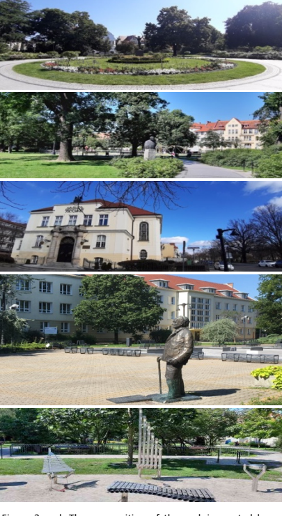
Figure 3, a-d. The composition of the park is created by a variety of plant life, surrounded by representative buildings of important cultural, educational and social importance in the city, including the facilities of a school and a music

Urban, historic public spaces with greenery, through their relationship with architectural surroundings, contribute to the urban structure of a city. They are often one of the most important elements shaping its identity. The coexistence of greenery with downtown buildings, by integrating it into the urban layout, creates not only the desired aesthetic and functional effects, but also contributes to establishing new relationships and social conditions, and is a city-forming factor. City parks are places that symbolize this symbiosis of nature and culture in a city. As green public spaces, they create conditions for leisure, and at the same time are a place of searching for attractive thematic solutions in open space.