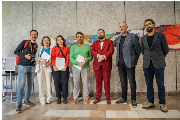
During a week, I attended wicker workshop and worked there with colleagues and students.