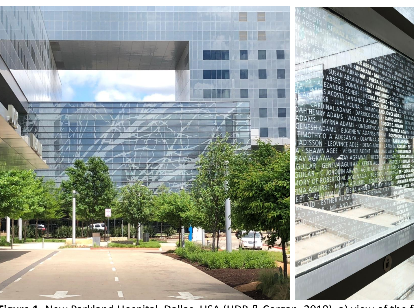
Figure 1. New Parkland Hospital, Dallas, USA (HDR & Corgan, 2010), a) view of the facade from outside, b) details of the glass coating from inside, source: Dip-Tech, Ferro Company.

The text on the façade contributes to the making of the company's image and branding – improving its brand awareness. Lettering motifs are important in the creation of an identity for an architectural space as well as its identification.