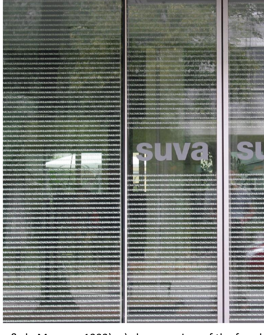
Figure 3. SUVA Offfice, Basel, Switzerland, (Herzog & de Meuron, 1993), a) close-up view of the facade, b) printout, photos by Maarten Helle.